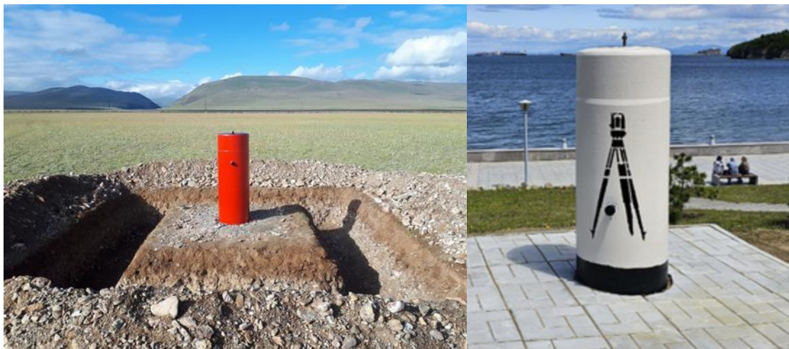
Figure 5. HGN points

A total of 396 HGN points are currently in operation.