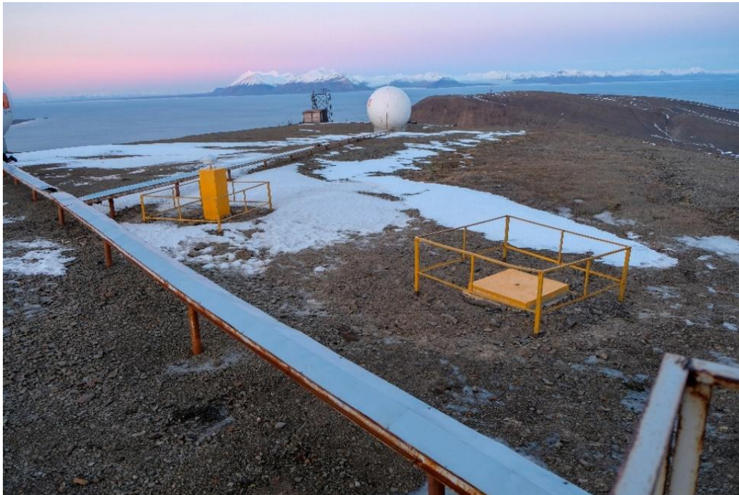
Figure 1. Main/working center of the BAGN point "Barentsburg" and the gravimetric site

According to the national standard of the Russian Federation GOST R 57374-2016 (Global navigation satellite system. Methods and technologies of geodetic works. Items of basic astronomical and geodetic network (BAGN). Specifications) [1] each BAGN point is a local network consisting of a one main, at least one working, two control and one gravimetric centres. At some BAGN points, the working center is combined with the main one. As an example, Figure 1 shows the BAGN point "Barentsburg", where the working center coincides with the main one and a gravimetric site is located nearby.