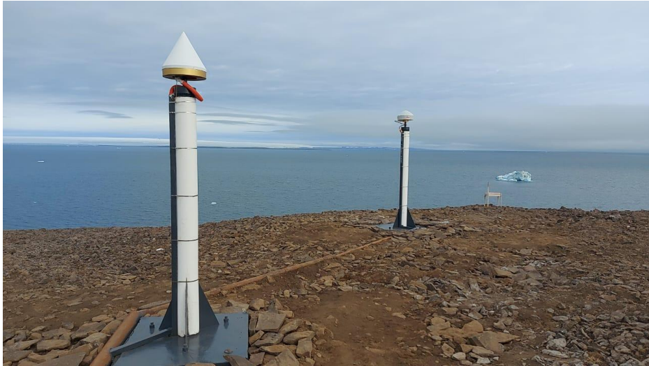
Figure 3. BAGN points on the Hayes Island (Franz Josef Land archipelago)

The role of BAGN stations in the study of earthquake processes is invaluable. On July 30, 2025, at 11:30 am local time, an earthquake occurred on the territory of Kamchatka Region and Sakhalin Region of Russia, which was recorded by BAGN points located in this region second by second.