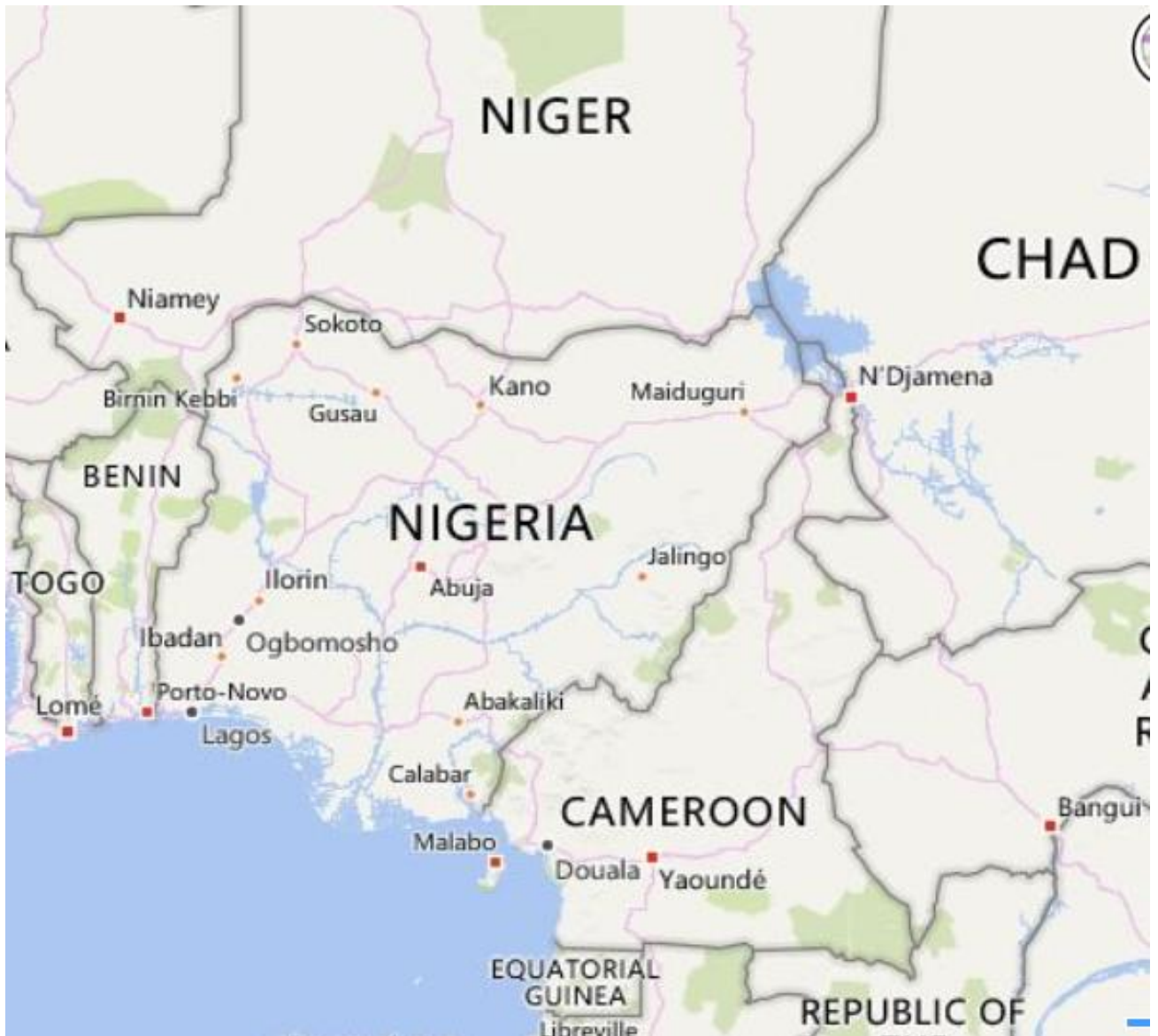
Fig. 2: Map of Nigeria bounded by neighbouring Countries

The most intriguing issues in boundary demarcation with these neighbouring countries are that all of them have different experiences in terms of historical, colonisation, developmental, inspirational, political above all language barriers. Furthermore, each section of these borders has two or more states/provinces of Nigeria/Cameroon sharing in common with neighbouring countries.