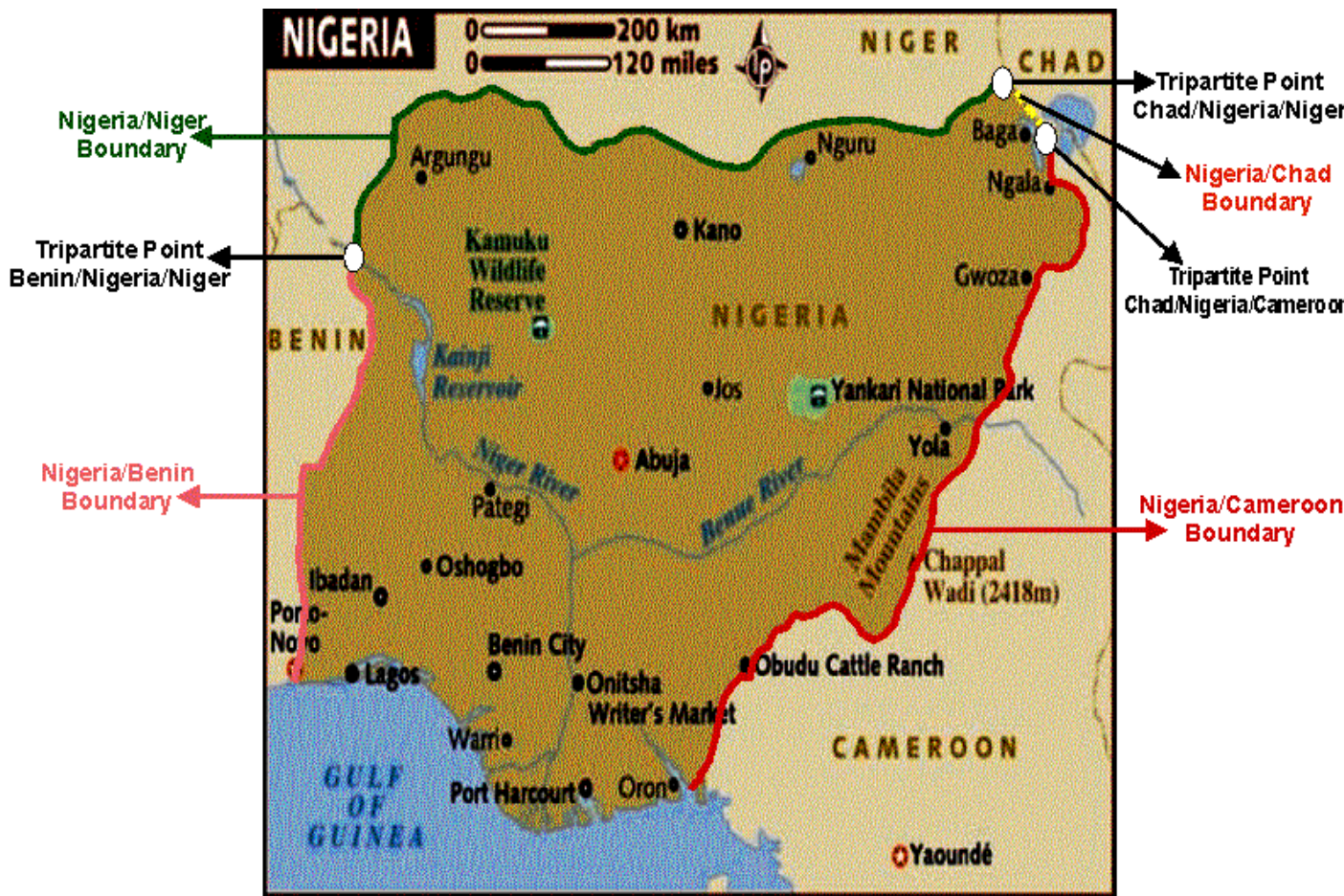
Fig. 4 Border Lines with Neighbouring Countries

In (Fig. 3) for example, Niger Republic, is sharing a common boundary with seven states of Nigeria, namely; Sokoto, Kebbi, Zamfara, Katsina, Jigawa, Yobe, and Bornu states. Similarly, on the other side of the boundary, that is, in the Niger Republic, there are five provinces namely; Dosso, Tahoua, Maradi, Zinder, and Diffa. Each of those states/provinces have different economic, political and social, maturity, independence, and experiences. The process of demarcation on this boundary can therefore be hectic. In all those states a lot have been achieved in terms of boundary demarcation along the 1,608km. The insignificant portion that was demarcated lacks border management derive. This is capable of instigating and provoking threats rendering the appreciable achievements recorded as a security challenge.